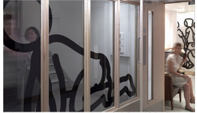
Babies like to look at shapes with black borders