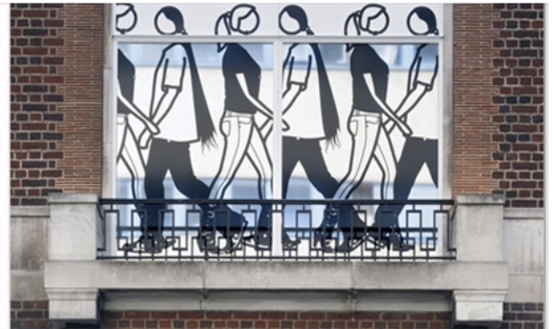
A view from outside the hospital