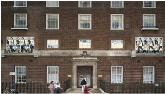
The exterior of the Lindo Wing

Acclaimed visual artist, London born Julian Opie is providing 40 panels to be displayed over the units four floors.